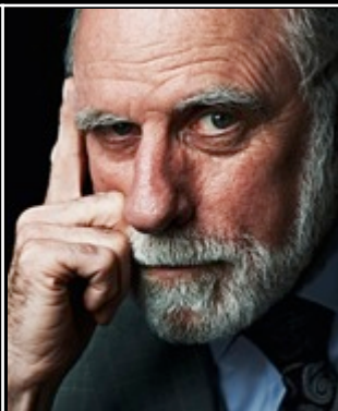
The Architect Vint Cerf [not present]