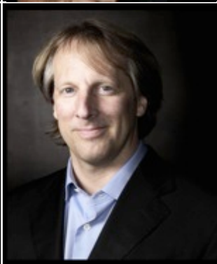
The Ambassador Rod Beckstrom @RodBeckstrom